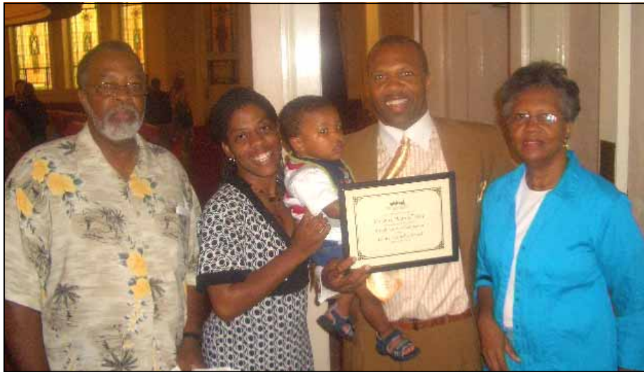
Trinity House-Big Bethel honoree and family