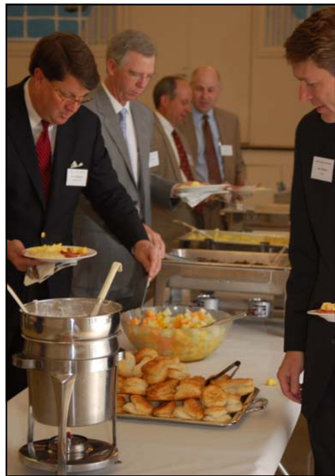
Spring 2007 Honorary Board Breakfast