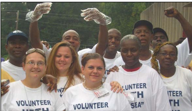
Trinity House-Big Bethel residents volunteer with HOSEA Feed the Hungry