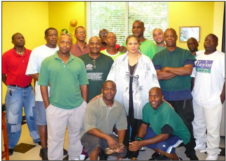
Trinity House-Big Bethel Film Class